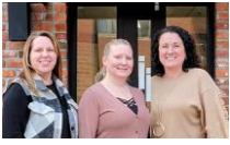
Training Team Coaches

Plan for your staff to attend a four day training; it sometimes does take more